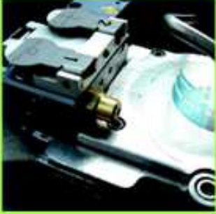
New cooling welding time indicator